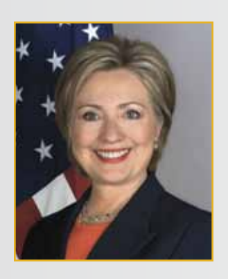
HON. HILLARY CLINTON U.S. Secretary of State