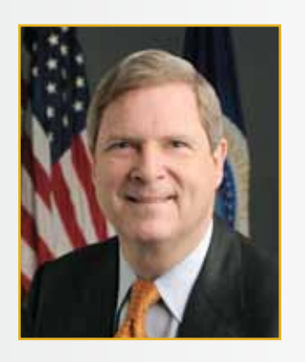
HON. TOM VILSACK U.S. Secretary of Agriculture